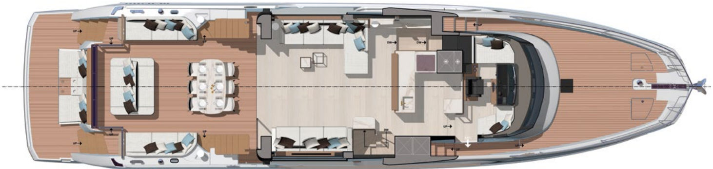
Main deck - Exterior dining version