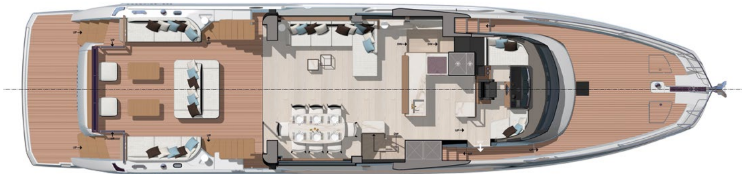
Main deck - Interior dining version